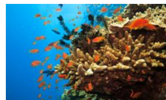
Natural Wonders of Australia and New Zealand