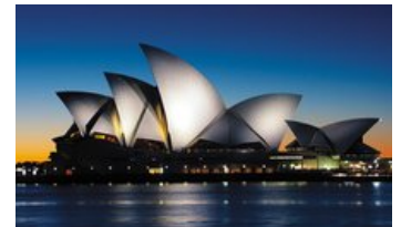
Splendors of Australia and New Zealand