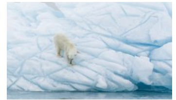
Northern Summer by Private Jet

Jordanians are known for their tremendous hospitality and communal meals. To receive a “Jordanian invitation” means to show up with nothing and eat everything offered. Hospitality permeates all aspects of the culture, and locals