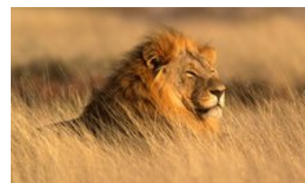
The Grand Safari: An Expedition by Private Plane