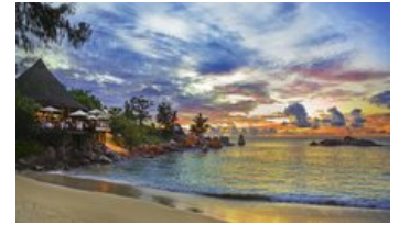
Cruising the Seychelles