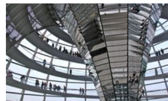
Eastern Europe & Beyond