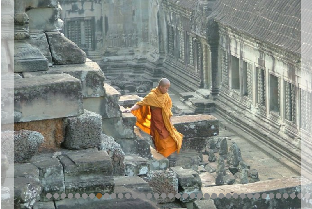
Monk at Angkor Wat